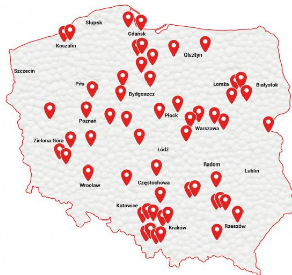
Figure 1. Companies producing polystyrene boards associated in PSPS

The Polish Association of Styrofoam Producers, based in Warsaw, has been operating since 2010 and brings together 28 leading manufacturers of polystyrene insulation boards used in construction on the Polish market. The organization co-creates technical standards and legal regulations for the production and application of polystyrene boards for thermal insulation in construction, cooperates with domestic and foreign organizations in the construction industry, scientific and technical institutions, state and local administration bodies for the development of polystyrene products and their applications. It undertakes numerous